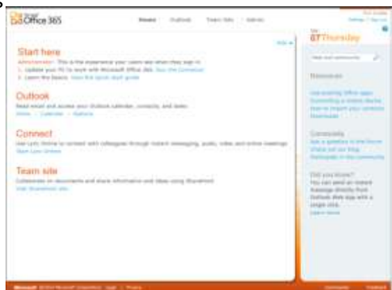
The user's home page for Office 365 for small businesses